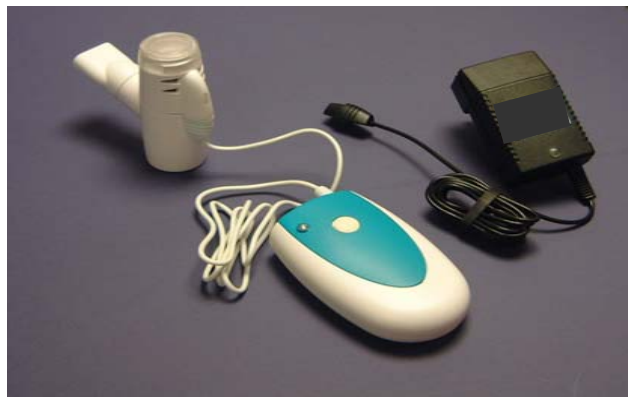
FIGURE 2: THE AERONEB® GO NEBULIZER